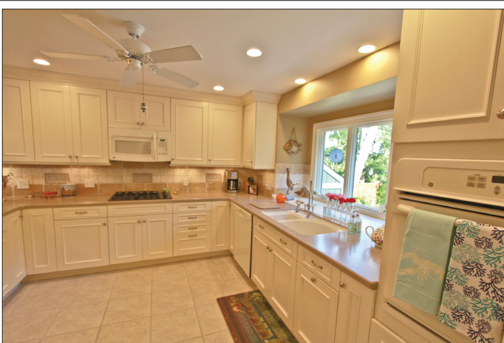
Special to the CAPE MAY STAR AND WAVE