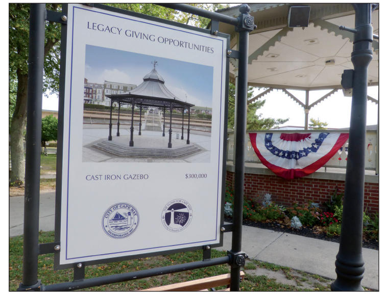
A sign at Rotary Park advertises legacy giving opportunities presented by the Fund for Cape May, which is raising money to help fund

HERE'S AN IDEA... BUY SOMEONE A GIFT SUBSCRIPTION TO THE CAPE MAY STAR AND WAVE.