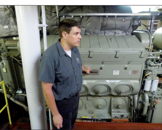
The Cape May-Lewes Ferry's MV Delaware returned home to Lower Township with two new engines following a fivemonth dry-docking.

Any questions call the Cape May City Recycling Office at 609-884-9570