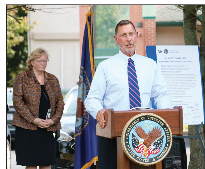
U.S. Rep. Frank LoBiondo announces Oct. 6 during a suicide prevention signing ceremony that the U.S. Department of Veterans Affairs has agreed to open a health clinic in the county.

American Made R 11:00, 2:10, 4:40, (7:20, 10:00) **The Snowman (Thurs Premiere) R [7:20, 10:00] ** No Passes • ( ) Fri - Wed • [ ] Thursday