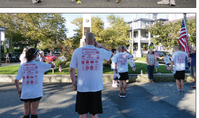
The opening ceremony was held at Sunset Beach, top. Its first stop was in Cape May, above.