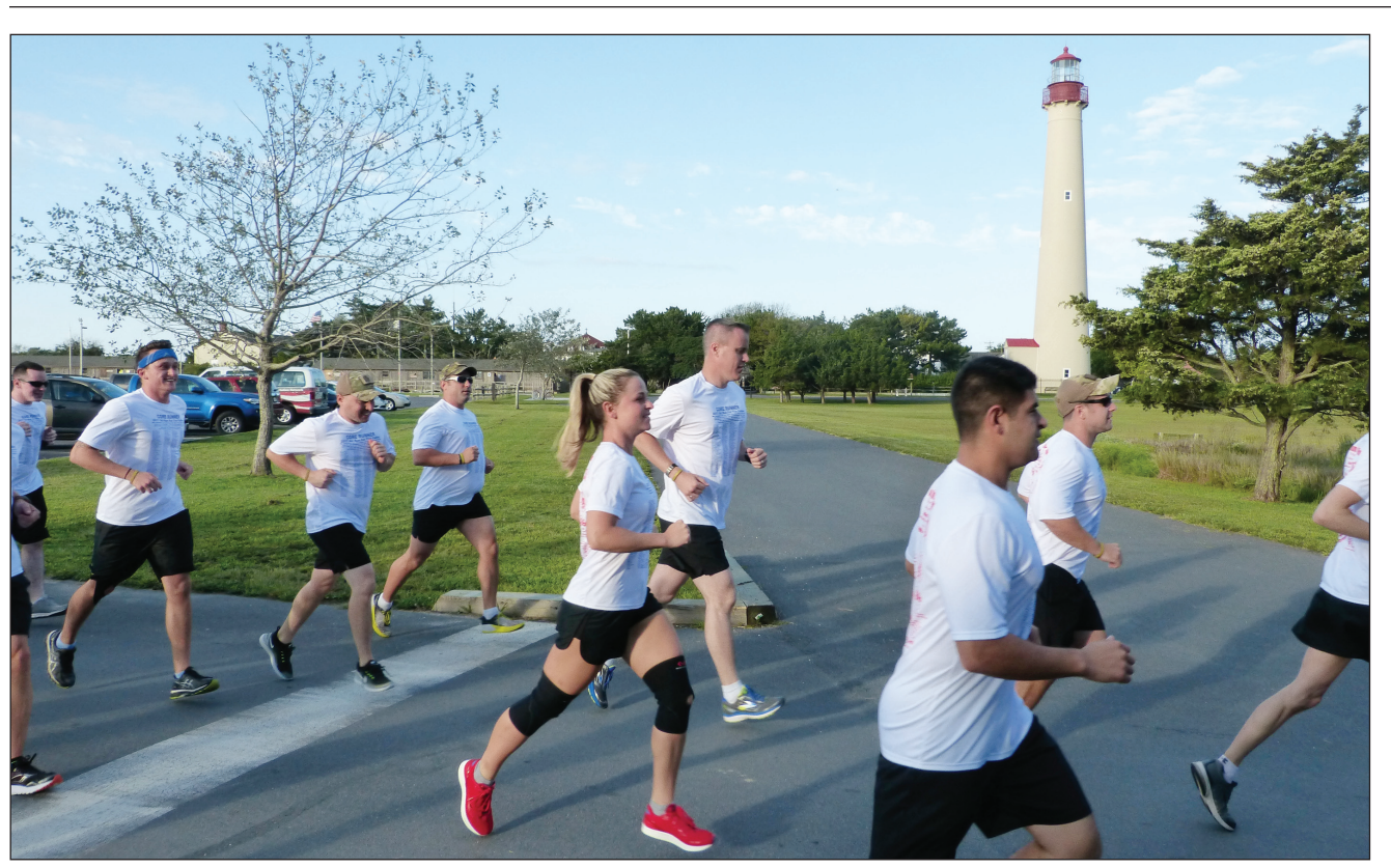
Jack Fichter/CAPE MAY STAR AND WAVE