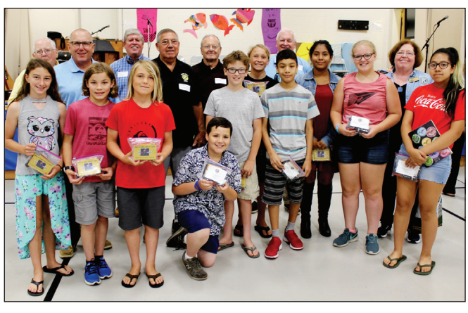
Members of the Kiwanis Club of Cape May pose with sixthgraders at West Cape May Elementary School, whom they The packages included a light, gave bicycle lights and other safety gear.