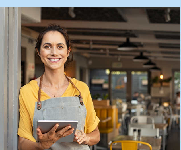
Community Banking for Over a Century