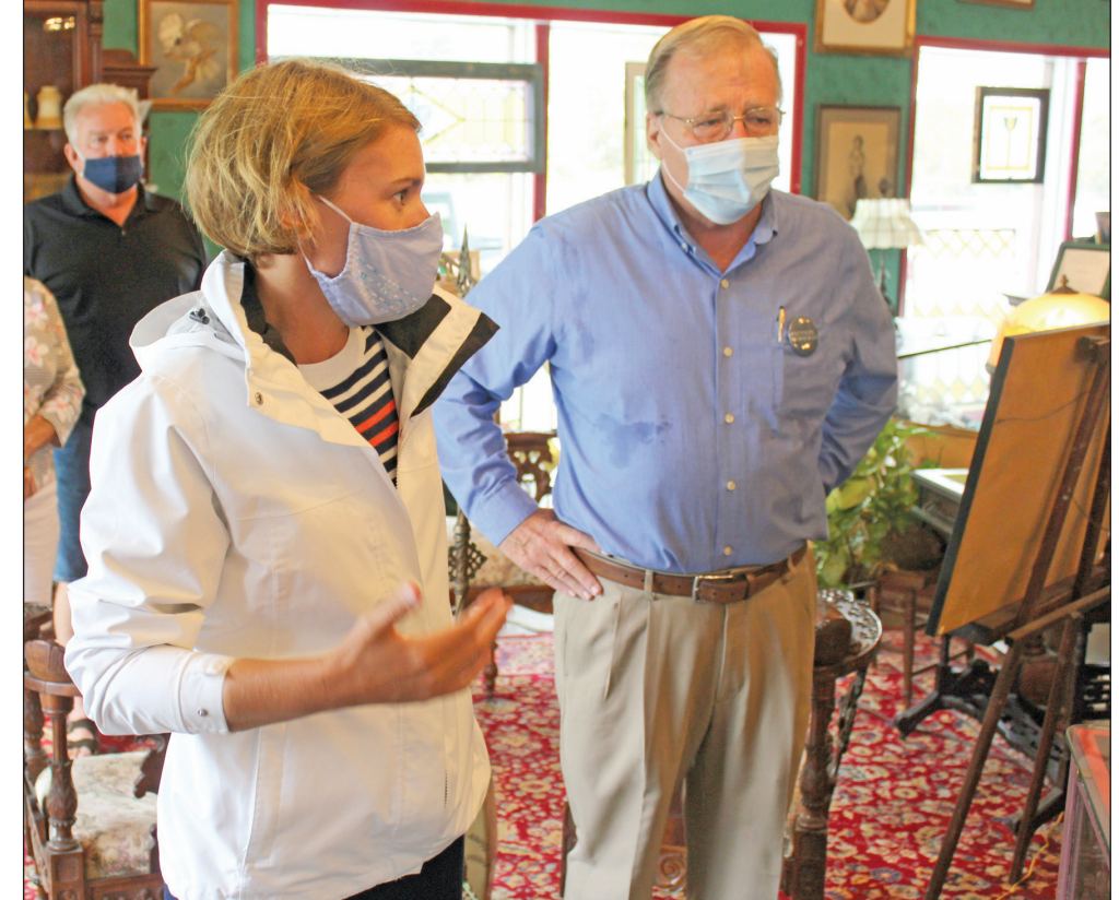
Jack Fichter/CAPE MAY STAR AND WAVE