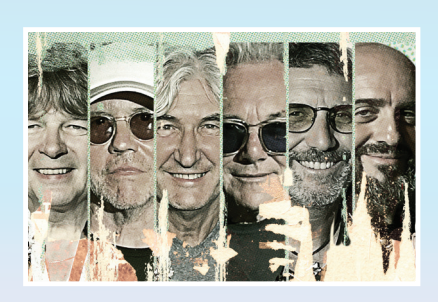
WEDNESDAY, AUGUST 24 DIRE STRAITS LEGACY BAND