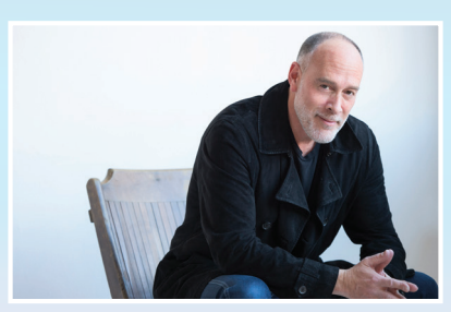
TUESDAY, AUGUST 30 MARC COHN