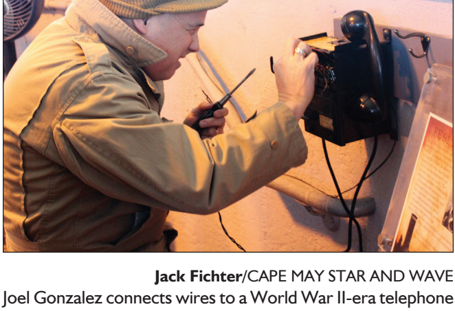
at Fire Control Tower 23 at Sunset Beach. The telephone,