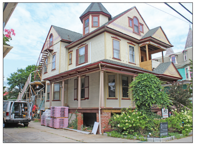
The Prince Edward Inn at 38 Jackson St. in Cape May now may move forward with an asphalt roof.