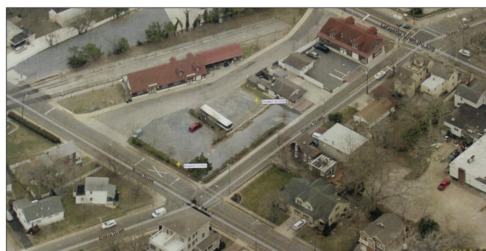
The Chamber of Commerce of Greater Cape May said the city-owned property at Bank and Elmira streets is unfit for a public safety building because the Welcome Center and its parking lot are important to tourism.

a call from some members of the public to construct two separate buildings, the firehouse at its current location and a police station at Broad and Elmira streets. She said the committee looked at that idea in 2017. The current Andrew Adornato, principal ocean and Cape Island