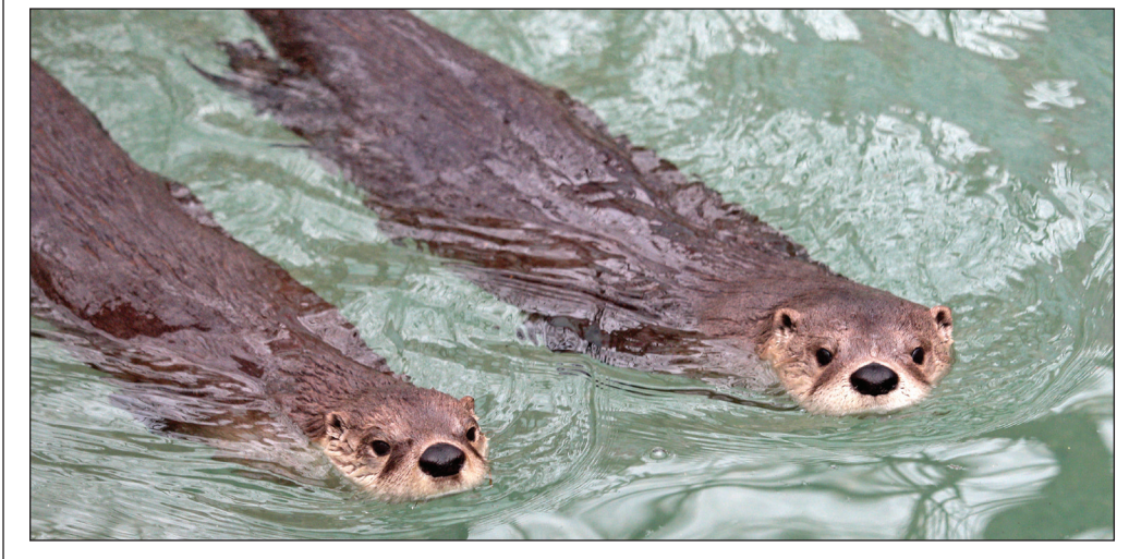
A pair of otters swims at the Cape May County Park and Zoo in late December.

of emergency Jan. 4 due to having dilapidated, obsolete or substandard buildings, municipally-owned land that has been vacant for 10 years and likely to be developed by private capital or lack of proper utilization resulting in stagnant conditions. Resident Jules Rauch said not one fact was exhibited in a report to prove the Acme market and buildings in front of the Methodist church were dilapidated or obsolete. Following the