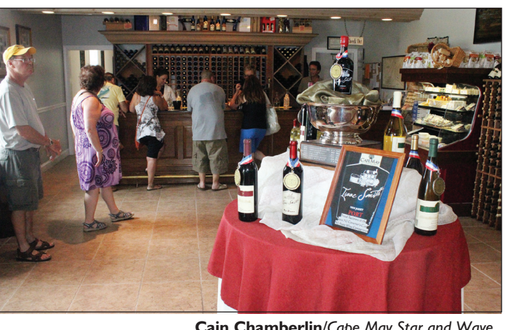
Above, the tasting room at Cape May Winery on Town Bank Road.