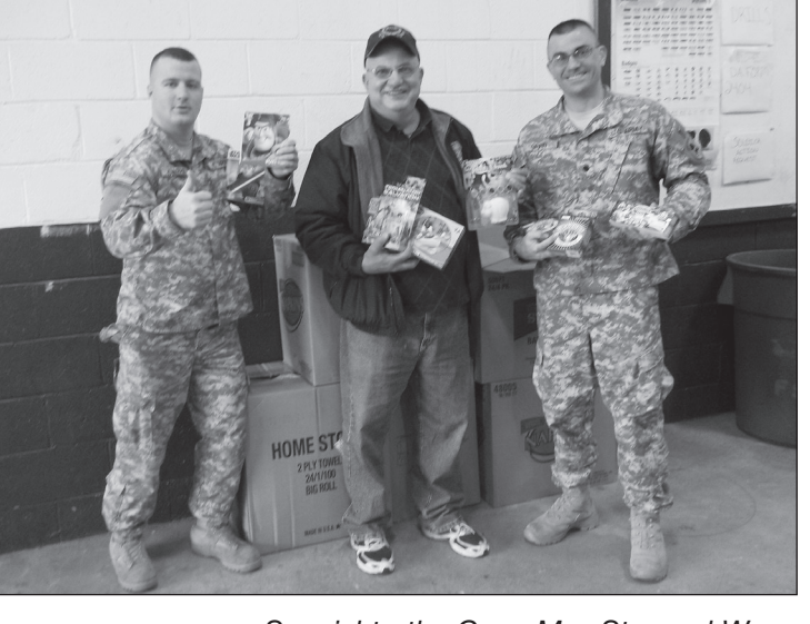
Special to the Cape May Star and Wave