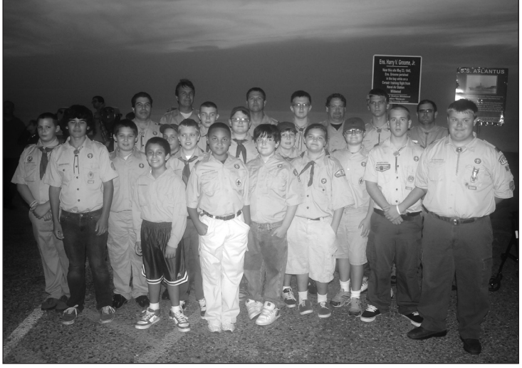
Above, Boy Scout Troop 87 participated in the Run For the Fallen remembrance ceremony held Sept. 27 at Sunset Beach to honor fallen service

She said borough representatives have disseminated false and misleading information to residents, to construction officials and to the media depicting Willow Creek Winery in a negative way or misstating the winery's business plan or intentions.