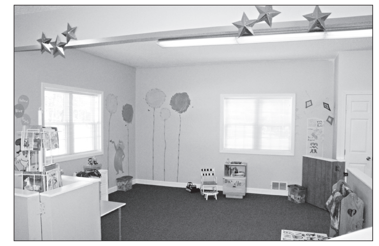
Cain Chamberlin/Cape May Star and Wave