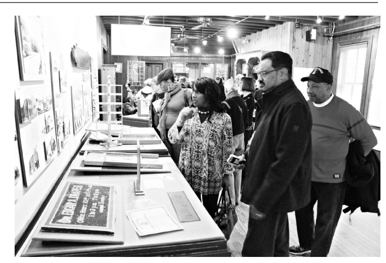
Cain Chamberlin/Cape May Star and Wave