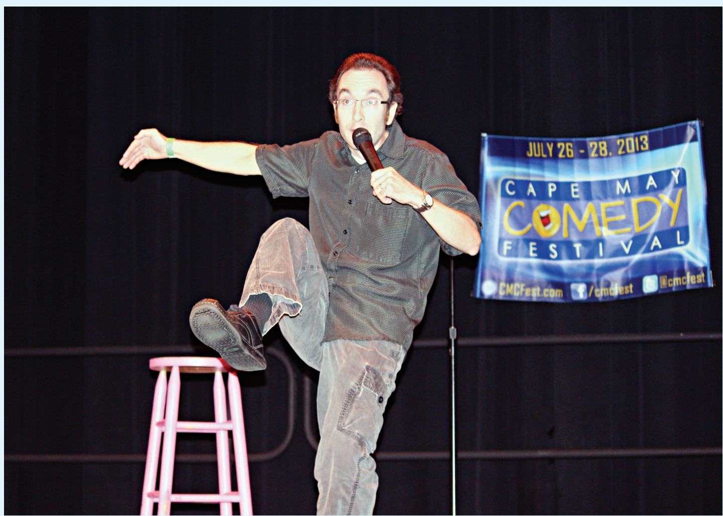
Cain Chamberlin/Cape May Star and Wave