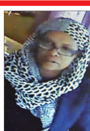
Surveillance footage captured this couple entering Artisans Alcove Estate Jewlers, followed by three others, prior to the robbery.