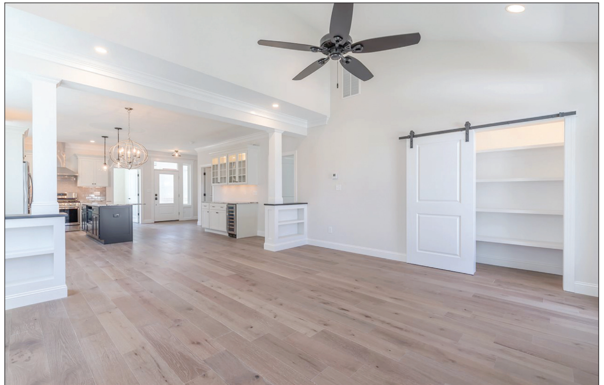
Special to the CAPE MAY STAR AND WAVE The four-bedroom home at 409 Cambridge Ave. is loaded with details, including including built-in connections for smart TVs, a private outside shower for beach days and easy maintenance windows and siding. Left, the outside of the home has modern appeal but classic lines with a gray exterior and white trim. Right, the living area features a high ceiling and built-in bookshelves.