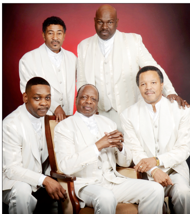
The Spinners are scheduled to play at 8 p.m. Monday, Aug. 1, at Cape May Convention Hall.

“I think he told her he couldn’t do an album at the time but he could pair her up with The Spinners,” he