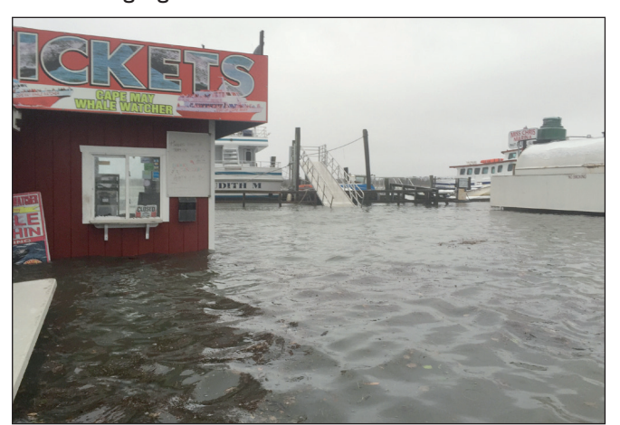
Floodwaters inundated the Miss Chris Marina during high tide.