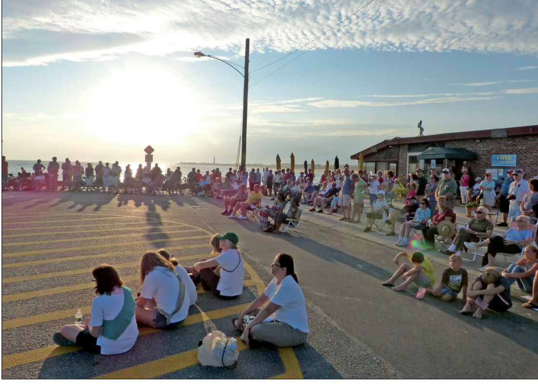
A sizable crowd gathered Sept. I I at Cape May's Sunset Pavilion to observe the city's Patriot Day ceremony on the 13th anniversary of the Sept. 11 terrorist attacks.