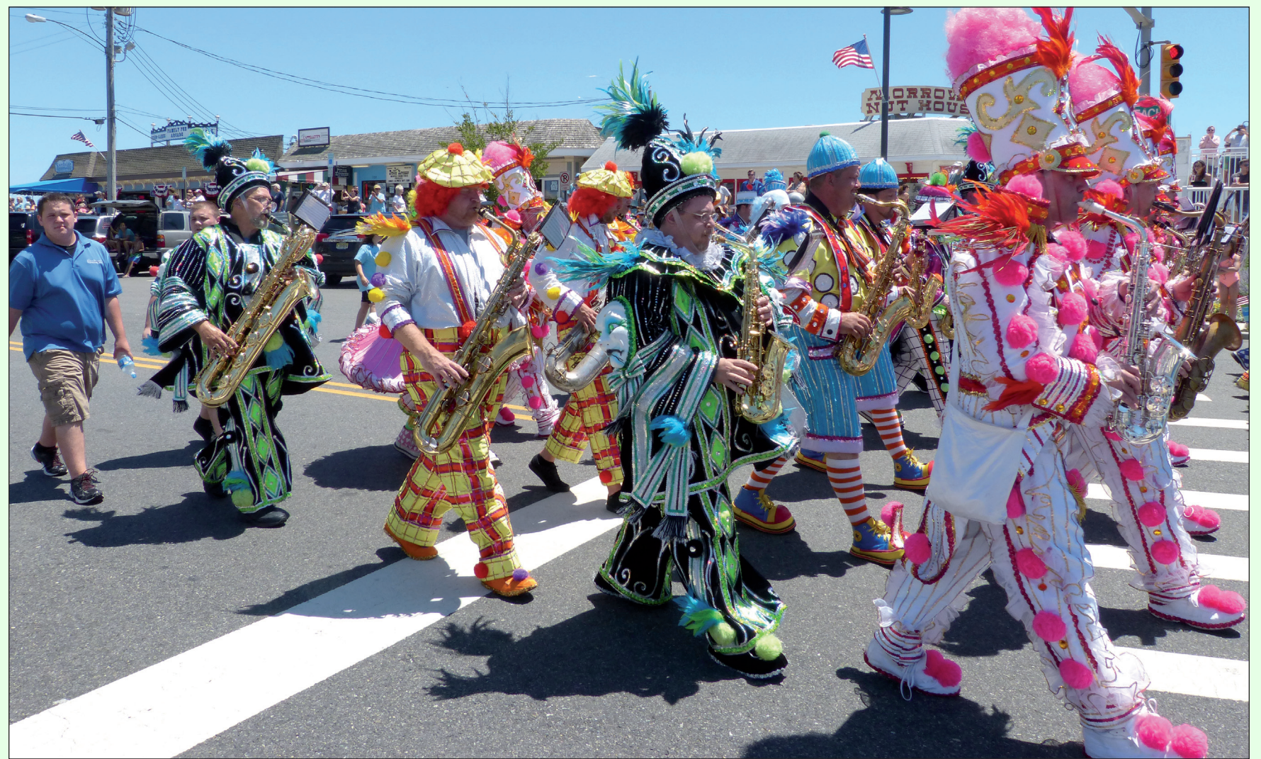
The Fralinger String Band makes its way along the parade route July 5 during Cape May's Independence Day celebration. See more photos on Page A8.