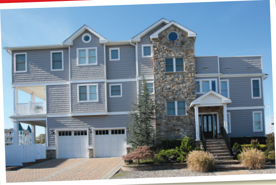
House of the week Page B1