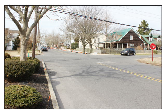
The intersection of Learning Avenue and Park Boulevard will become a four-way stop.

Cape May Point is in spring bloom but slightly behind inland towns due to wind from a 48-degree ocean. Trees and daffodils are flowering at Pavilion Circle overlooking St. Agnes Chapel by the Sea.