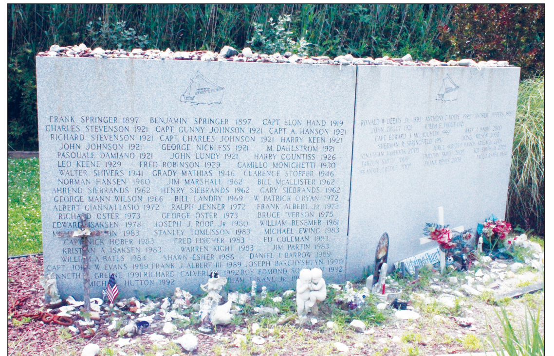
Above, part of the Fisherman's Memorial bearing the names of fishermen from Cape May County who have been lost at sea.