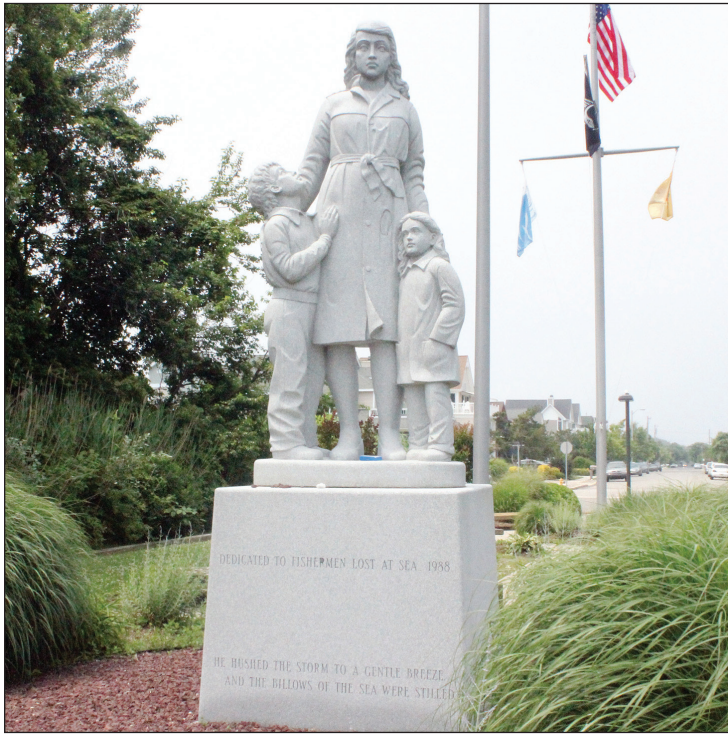
Above, the Fisherman's Memorial on Missouri Avenue is the site of the annual Blessing of the Waters. This year's ceremony is on Saturday at 5:30 p.m.