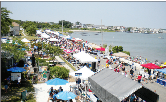
A scene of last year's Harbor Fest from the Nature Center.