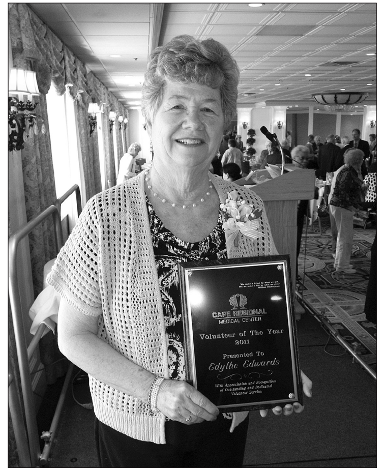
Special to the Cape May Star and Wave

"We need to make ourselves more attractive and compete on a state, national and world-wide level," she said.