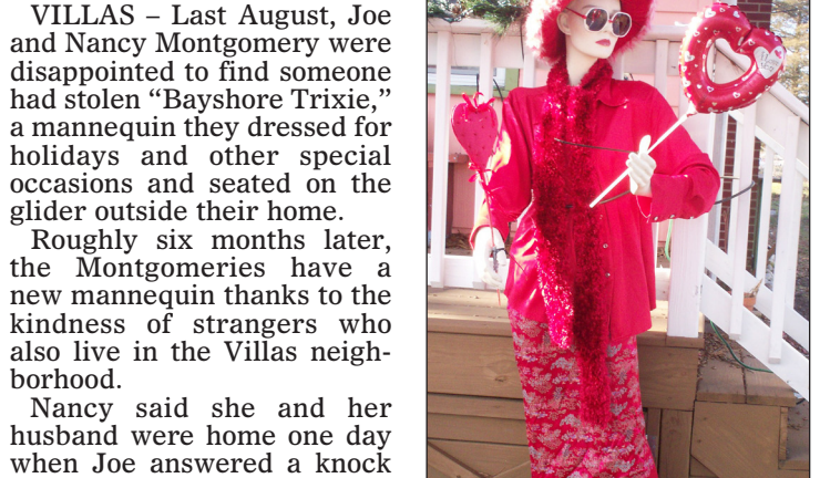
"Bayshore Tootsie" has replaced the stolen "Bayshore Trixie."