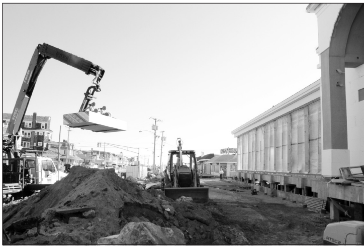
Above, materials being delivered to the Convention Hall construction site on Beach Avenue. Below, a shot from the inside showing progress on the construction, due to be completed in May.