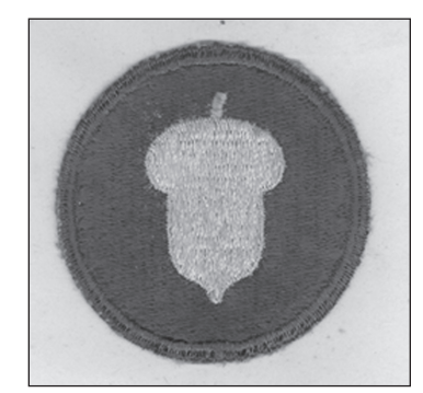
87th Infantry Division

He found American engineers working to install a